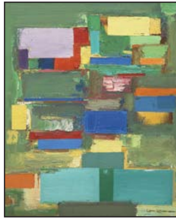
Hans Hofmann: Morning Mist, 1958