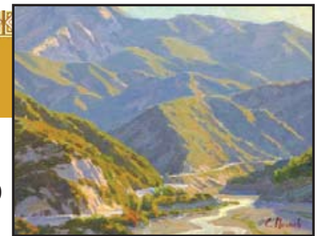
Charles Muench, San Gabriel Canyon Road, Oil on linen 2009 Exhibition

Annual Gold Medal Exhibitions held at the Pasadena Museum of California Art.