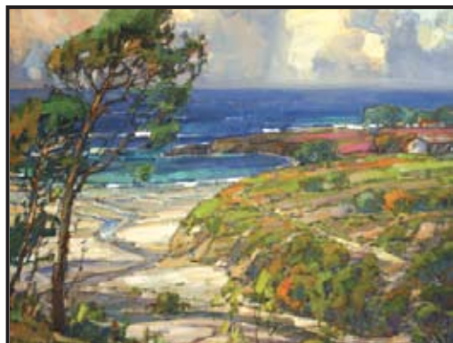
Karl Dempwolf, Where Malpaso Creek Enters the Sea, Oil on canvas 2009 Exhibition